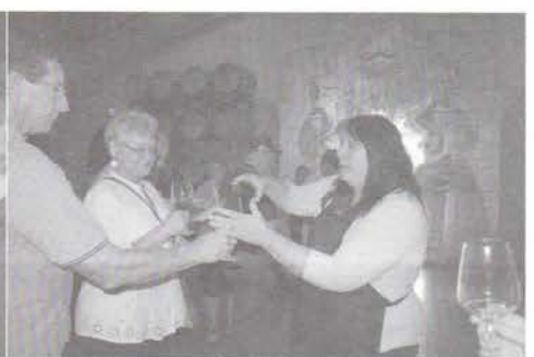
The Sonoma winery tours were a blast and everyone enjoyed lunch on Pier 39!