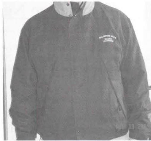
Men's Jacket navy with beige, $42.00 each.