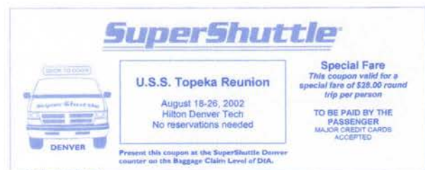
Super Shuttle Coupon

The Super Shuttle of Denver offers Topeka sailors round-trip transportation from Denver International to the hotel for $28.00, or $18.00 one way. If you have not received a coupon, cut out and use the one below. Also below is the shuttle desk location in the airport. There should be a sign at the desk welcoming Topeka sailors.