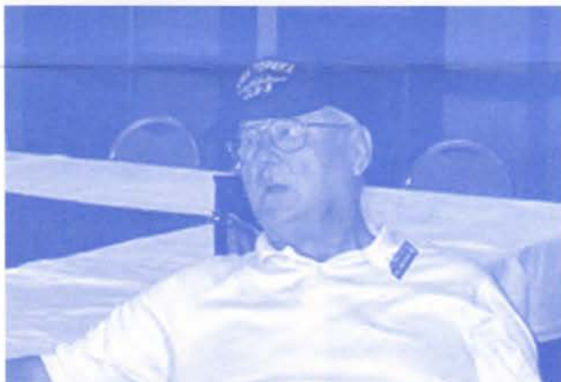
That's not the way I remember it!!"