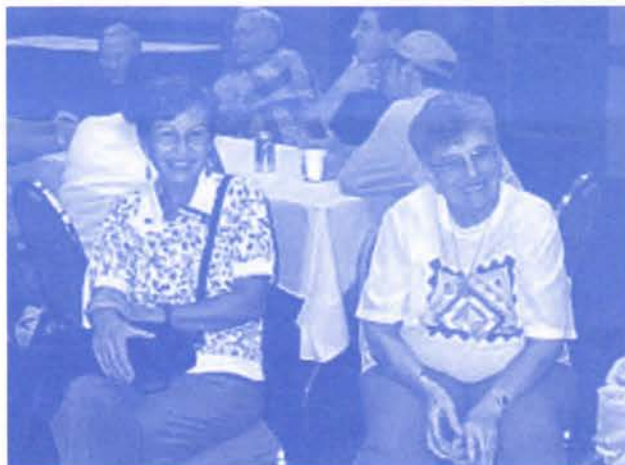
"These reunions are really great"