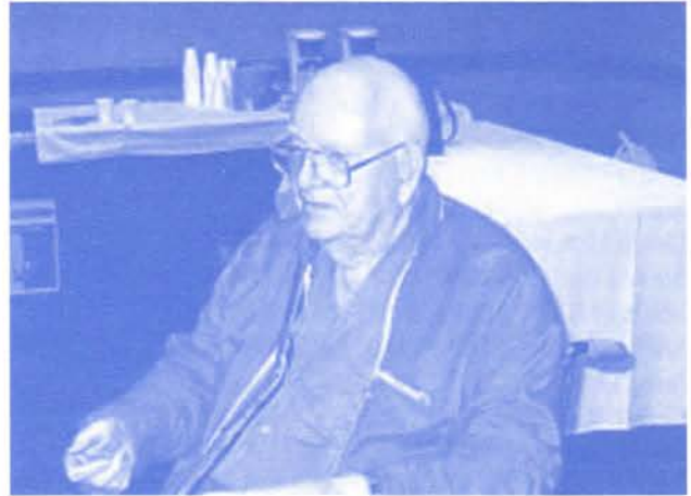
It's grrrreeeaaaaaat to be here!!