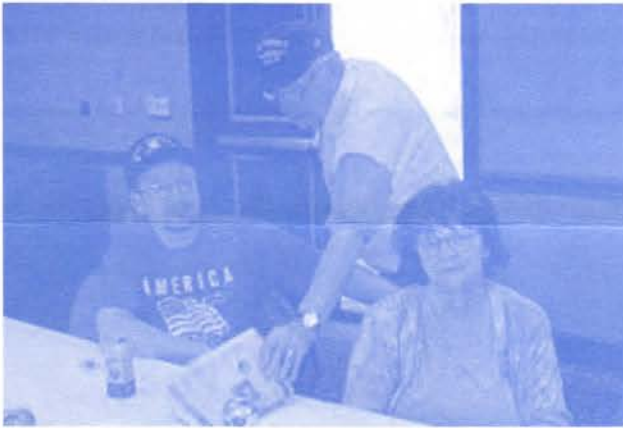
Can I have your paper?