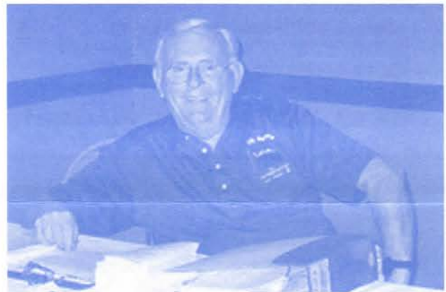
And which tour for you Sir?