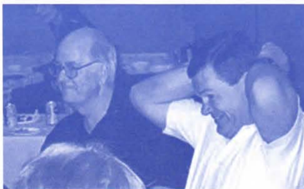
By next reunion, Radarmen will take over!