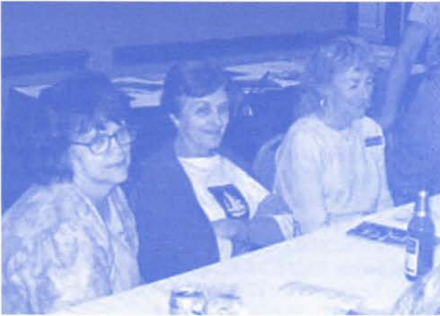
After a long day of touring