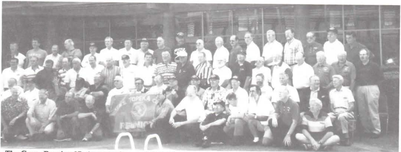
The Gang, Reunion 97. At press time , we had not yet received the official group photograph so we had to use this snapshot. How many can you recognize? Next issue we will publish the official picture.