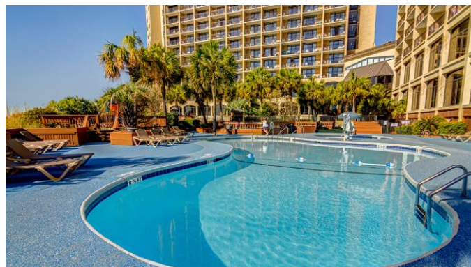
Beach Cove Resort, Myrtle Beach

Projected tours include a dolphin and wildlife cruise, a tour of Hobcaw Barony Plantation, Brookgreen Gardens, Barefoot Queen dinner cruise and maybe an all-day tour to historic Charleston.