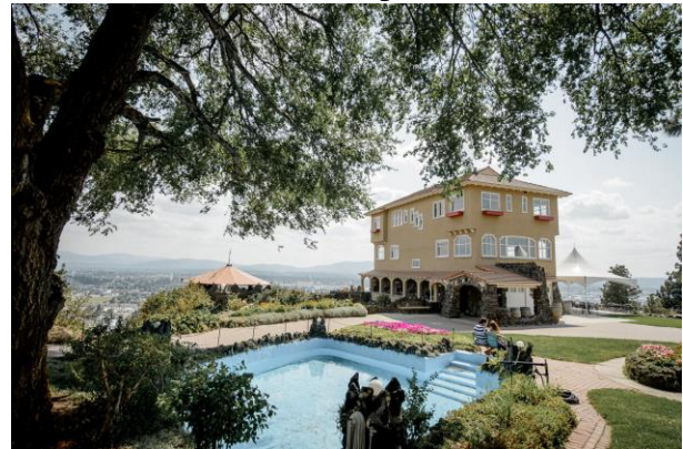
Arbor Crest Wine Cellars