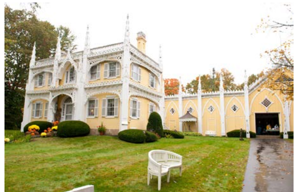
The Wedding Cake House

Cost: $74.00 per person (Subject to change)