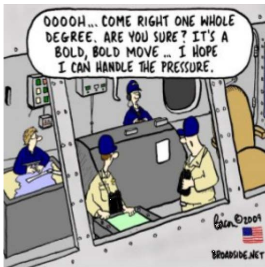
Helmsman with an attitude