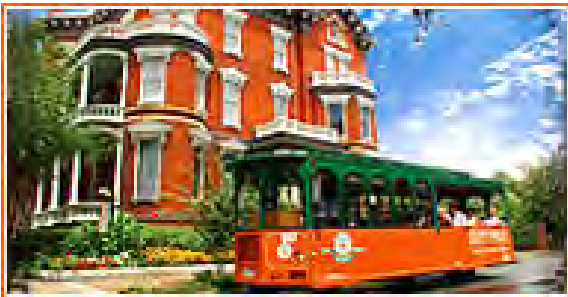
Trolley Stop 2 is at The Inn At Ellis Square!

Old Town Trolley has been entertaining visitors to Savannah for over 30 years, and while you're aboard their open-air trolley, the breezes keep you cool. Plus, you're not driving around in your car, looking for parking and getting in and out of your car at dozens of different attractions. The tour is one of the most comprehensive sightseeing excursions available, showing you more than 100 of Savannah's best points of interest including The Andrew Low House, the Cathedral of St. John, and the Kehoe House, Forsyth Park, River Street and more. The onboard guides are funny and knowledgeable so you learn a lot about the city's history while being entertained. The tour also allows you to get off and on and linger at any of its 16 stops as long and as much as you want.