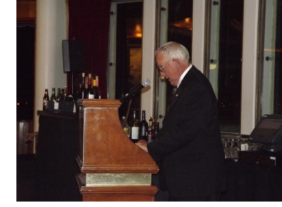
I hope you enjoy the photo pages from the 2013 Long Beach Reunion. I received tons of pictures and have tried to show a sample of attendees and events. Check out the website for more.